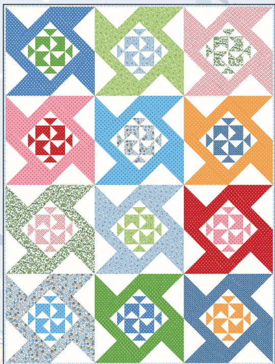
Swift by Sew Emma (57 x 74)