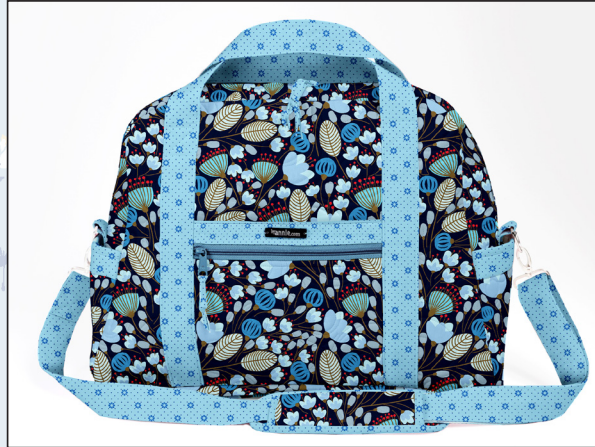
Ultimate Travel Bag 2.0 by By Annie