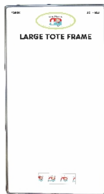
FQG139 Large Tote Frame