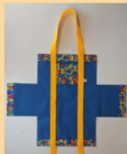
Add Pocket & Handles