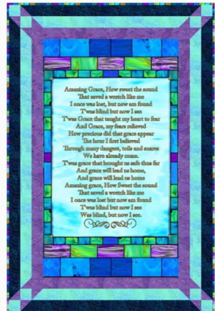
Layout Option 3