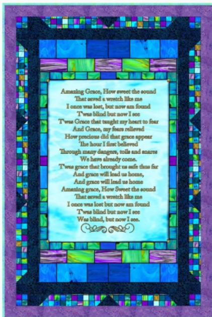
Layout Option 1

How to order: Email joanne@thefatquartergypsy.com for both FQ Gypsy and Swirly Girls patterns.