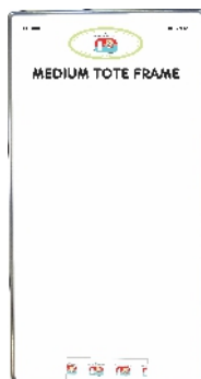
FQG138 Medium Tote Frame