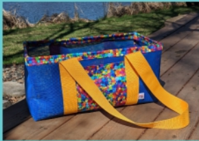
Use Strapping for Handles or make them from yardage