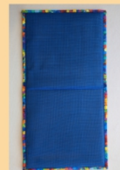
Make Bottom Insert