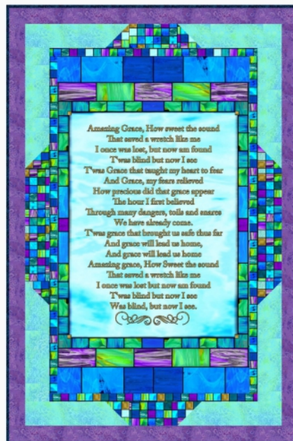
Layout Option 2