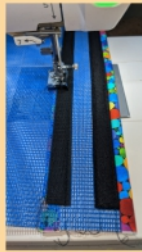
Add Top Bands & Velcro