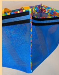
Sew Sides & Add Trim