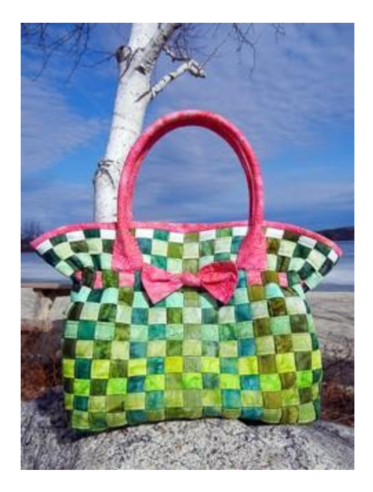
"Adorable Bag" from <u>Aunties Two Patterns</u> (more wovens!)